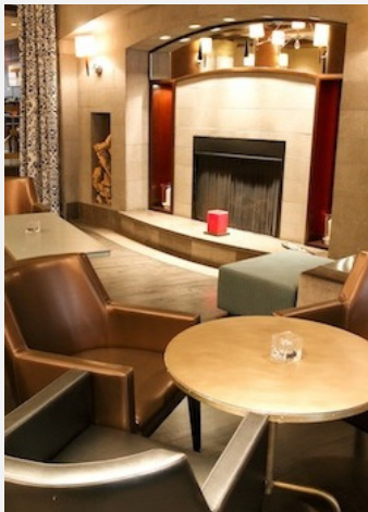
Lobby at le St. Sulpice Hotel, Montreal

The expansive suites at Le St. Sulpice are evocative of urban condos, furnished with leather armchairs and upholstered sofas in warm earth tones. Ranging in size from 500 to 1500 square feet, all suites feature a living space and a separate bedroom (or two or three), with desk and fully-equipped kitchenette, including microwave and refrigerator. French windows overlook the garden courtyard or the limestone buildings of Old Montreal. Bathrooms are spacious, with deep soaking tubs and walk-in showers large enough for a ménage à trois.