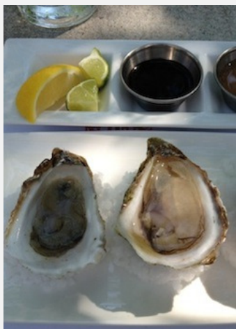
Oysters at Les Eclusiers par Apollo

Les Eclusiers par Apollo: Situated on the Old Port of Montreal along the St. Lawrence River, Les Eclusiers (meaning "locks," as in water) is Chef Giovanni Apollo's homage to the gastropub spirit. Widely-celebrated and well-loved for his original eponymous restaurant in downtown Montreal, Chef Apollo offers inspired creations made from locally-sourced foods at Les Eclusiers par Apollo. In summer, the setting is sublime - and dining al fresco is a taste of la dolce vita in Old Montreal.