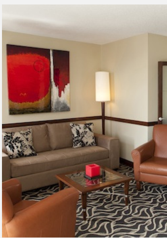
Detail of suite at le St. Sulpice Hotel, Montreal