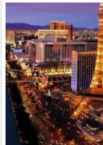
Las Vegas Strip to Become Runway for Fashion's Night Out