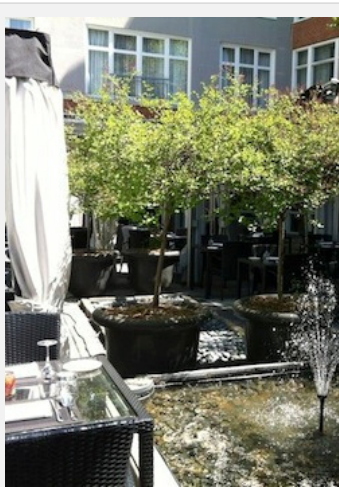
Sinclair Terrace