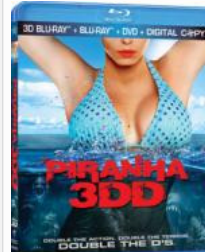
"Piranha 3DD" on Blu-ray!